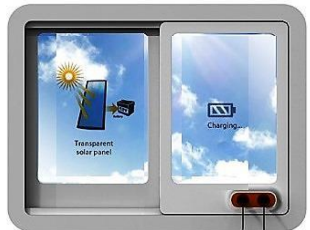
Transparent solar cells ( watch video1 )